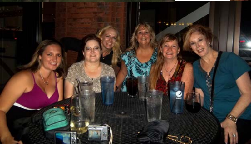
Out on the town with the San Diego Chapter Ladies