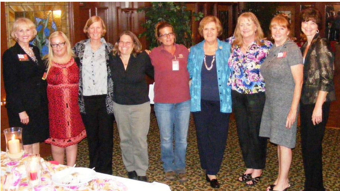
Duly Installed 2011-2012 Central California Coast Chapter 174 Board of Directors