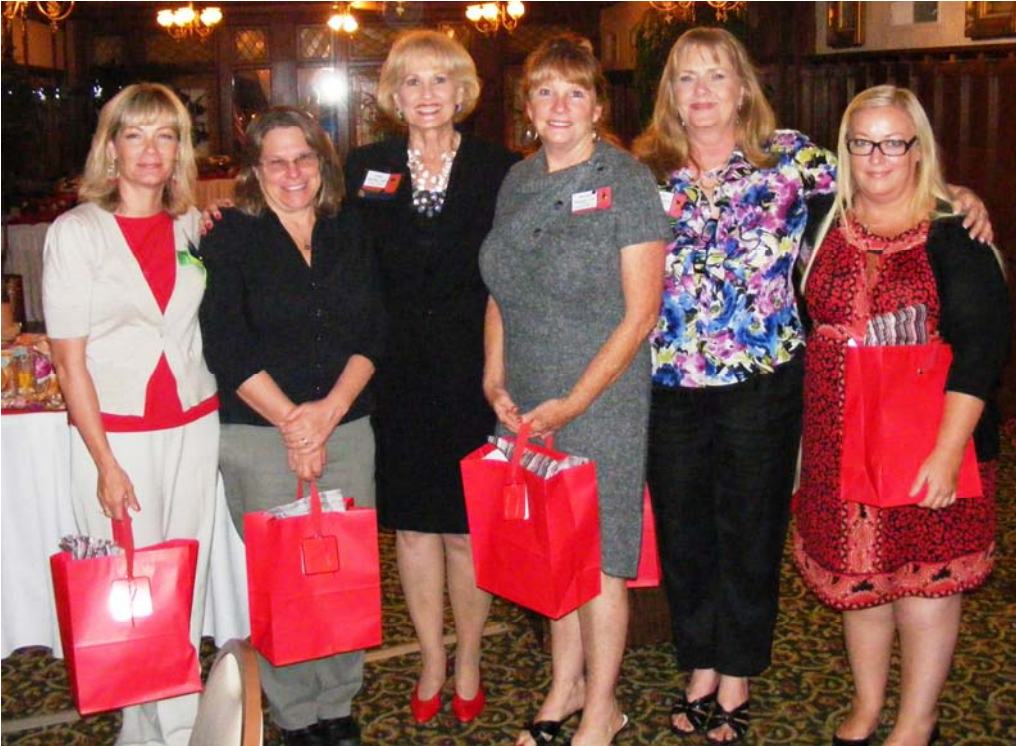
2010-2011 Outgoing Board of Directors