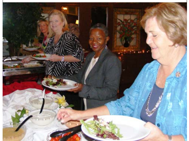
Members and Guests enjoy a delicious buffet