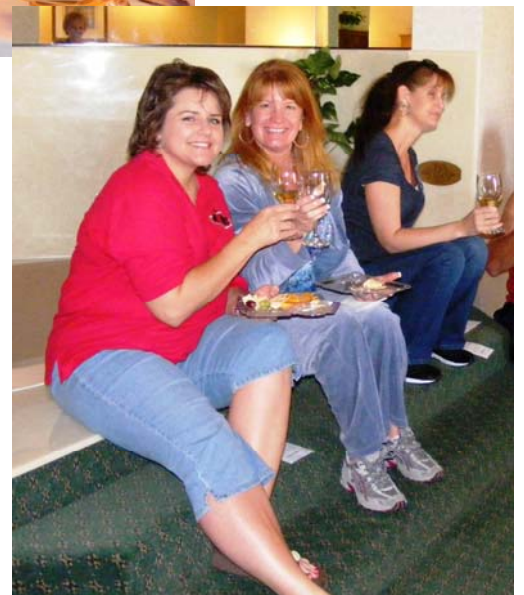
Hospitality, Registration and Wine Tasting