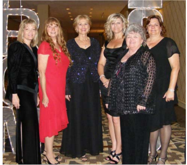
It's Prom Night and No Date!