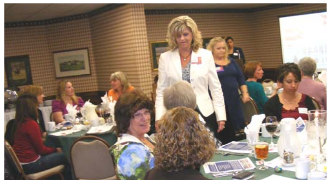
Members and guests visiting and networking