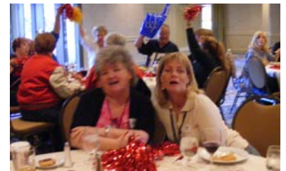
Party, party, party!